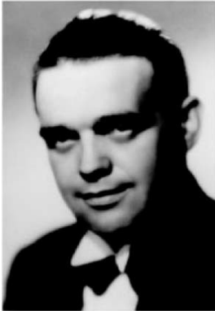
Franz Bardon, circa 1946